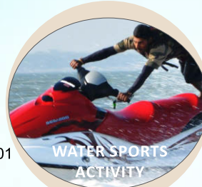
WATER SPORTS ACTIVITY