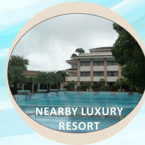
NEARBY LUXURY RESORT